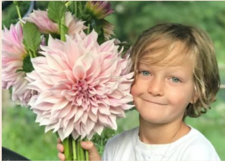
CAFE AU LAIT